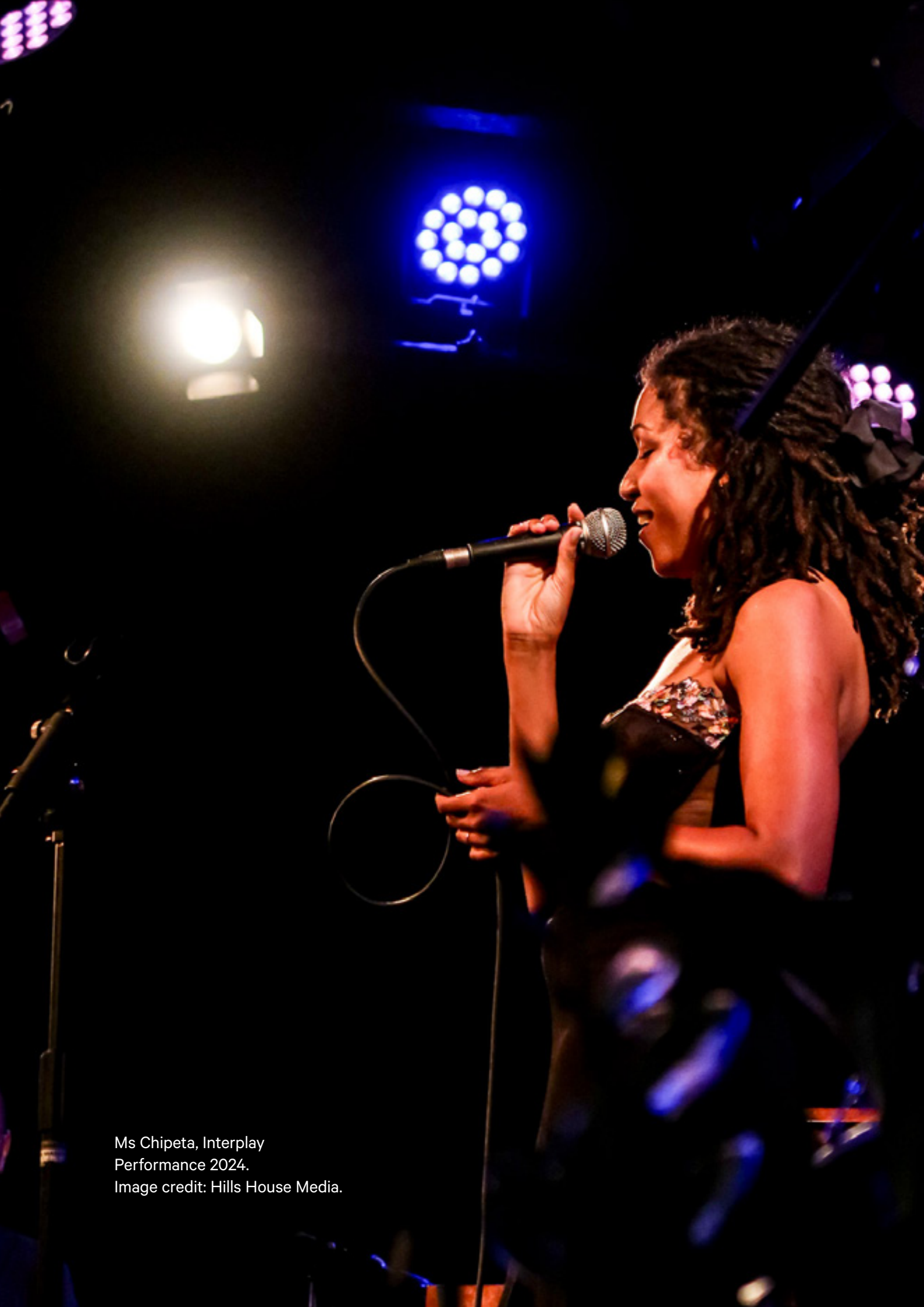
Ms Chipeta, Interplay Performance 2024.